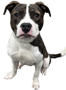
Trey, a Pit Bull Terrier Mix is available for adoption at the Mahoning County Dog Warden.

In celebration of the Feast Day of St. Francis Assisi on October 4, the patron saint of animals, St. Catherine of Siena Parish will be collecting pet food, supplies, and enrichment toys to benefit Friends of Fido at the Mahoning County Dog Warden. We appreciate your compassion for all of God's creatures and your support for their caretakers.